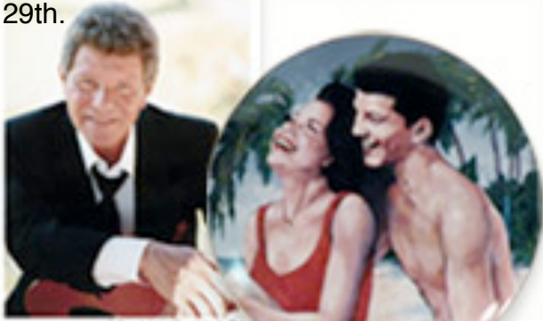
Frankie and Annette Funicello In Their 1963 Movie, "Beach Party" MEMORABILIA